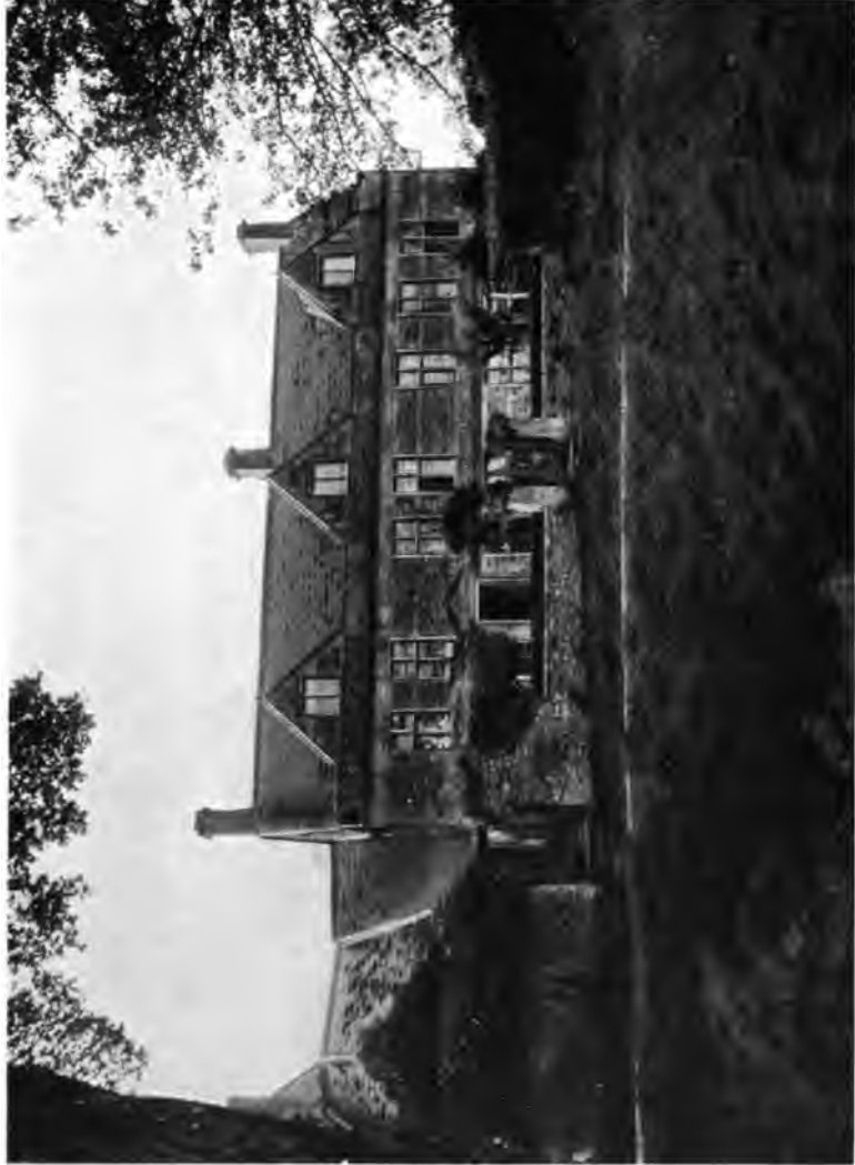
RUDGE HALL, NEAR BECKINGTON, CO. SOMERSET, ENGLAND, THE ANCIENT SEAT OF THE TREE FAMILY